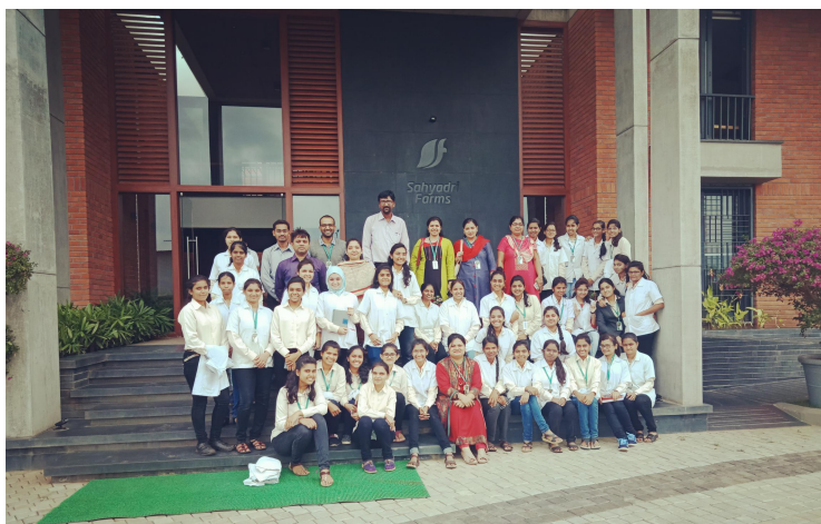
Third Year B. Pharmacy Students visited to Sahyadri Farms , Mohadi, Nashik