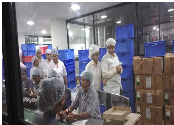
Third Year B. Pharmacy Students visited to Reve Pharma , Musalgaon MIDC, Sinner