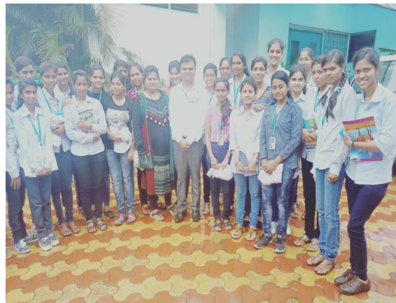
Final Year B. Pharmacy Students visited to Vital Healthcare Pvt. Ltd. , Satpur MIDC, Nashik